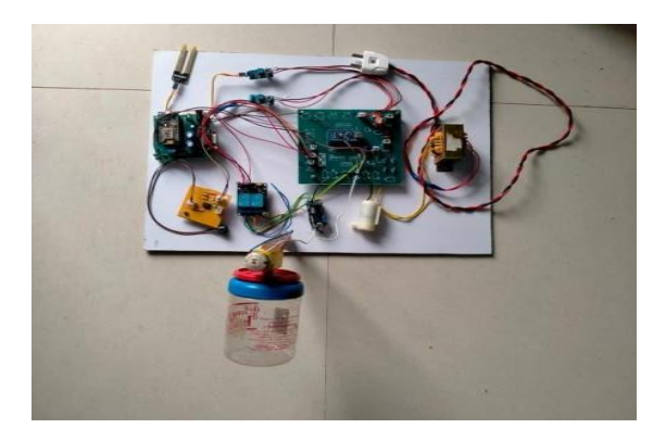
Figure 2 Implementation results

In this section, the experimental result based on automatic water irrigation and pesticides spraying using IOT is given and repel the animals.