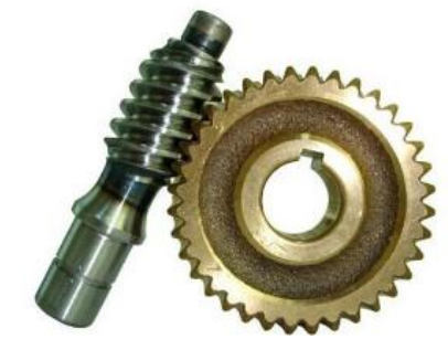
Fig 3.Parking situation of worm and gear