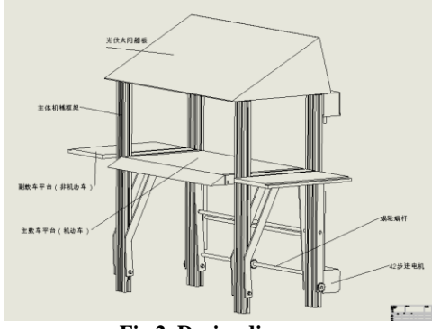
Fig 2. Device diagram

3, a reduction gear set, a stepper motor, and a transmission shaft, gears, etc.