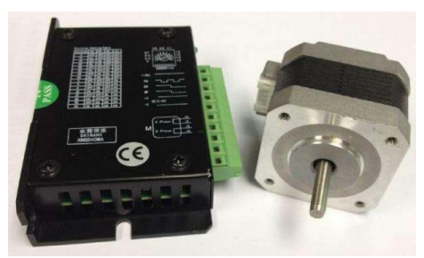
Fig 6.Stepper motor and drive

system uses photovoltaic solar panels, and the backup power source is the grid in the residential area. The two interact with each other to achieve a dynamic energy balance. The CNC system[7] is a Bluetooth module based on an Arduino chip[8].