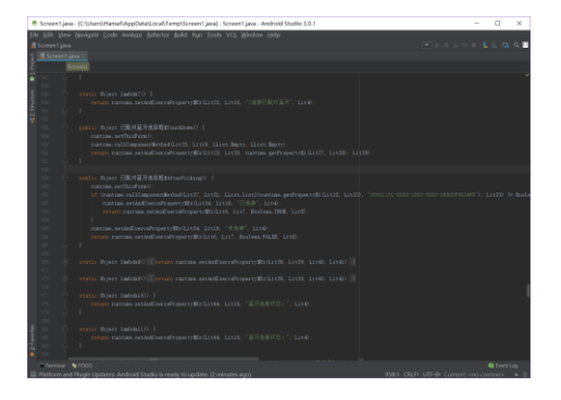
Fig 7. Procedure code

3 Chip adopts main control board UNO(R3) and Bluetooth module(HC05).