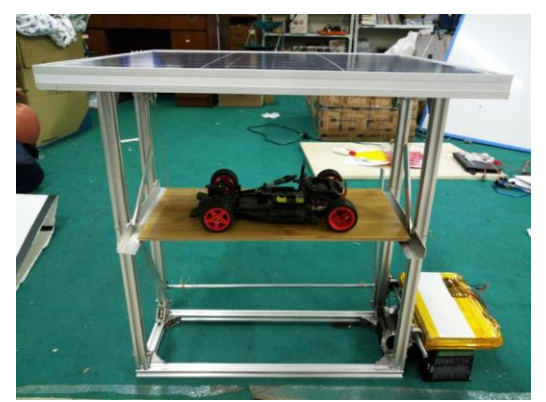
Fig 10. Picture One

⑤Incorporate the innovative model of "Pedestrian Overpass". During off-peak hours, this device can be connected to each other to form an "air corridor", eventually forming a "overpass system" in the residential area, avoiding the parallel use of people and vehicles and facilitating the passage of residents.